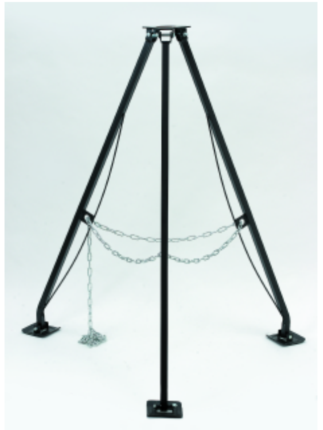
#915000 Fifth Wheel Stabilizer